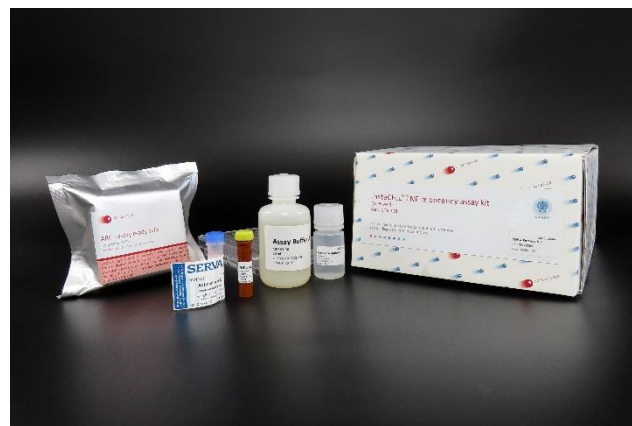
Figure 1: instaCELL TNF- \alpha potency assay kit

The instaCELL TNF- \alpha potency assay kit is based on the WHO publication "Report on a Collaborative study for proposed 3rd International standard for Tumor Necrosis Factor alpha (TNF- \alpha )" 6 . It includes prequalified Assay Ready L-929 Cells as well as media, reagents, international TNF- \alpha standard control, and 96-well plate to perform the assay according to the WHO. Assay Ready Cells are frozen cell aliquots which can be used directly in the assay without prior cultivation, basically like a reagent.